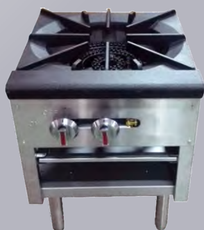
RB-1 Countertop Stock Pot Range

Dimension: 36×28×13 inch Power: 6 x 25,000 BTU 3/4" rear gas connection