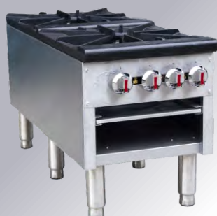
RB-1D Countertop Stock Pot Range

Dimension: 18×21×23 inch Power: 80,000 BTU 3/4" rear gas connection