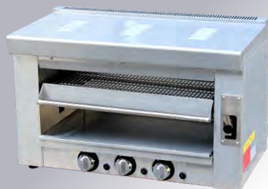
REB-02-L Gas Salamander

Dimension: 35x24x23 inch LPG: 2540Pa / 0.93Kg/h NG: 1000Pa / 1.11m³/h Power: 10.25kW/35,000BTU Net Weight: 72kg