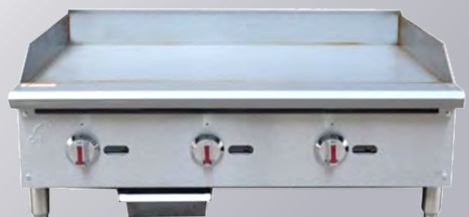
C36TGG Countertop Gas Griddle 36" (Thermostatic Control)

Dimension: 24×28×15 inch Power: 2 x 30,000 BTU U style burner Thermostatic control: 200°F to 575°F 3/4" rear gas connection