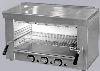
REB-02 Gas Salamander

Dimension: 35x22x23 inch LPG: 2800-3700Pa / 0.93Kg/h NG: 2000-2500Pa / 1.11m³/h Power: 11.5kW/39,238BTU Net Weight: 74kg