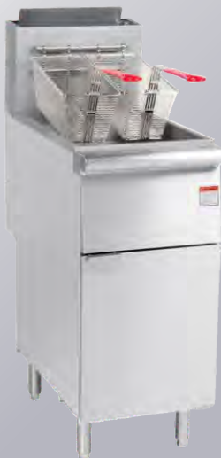
F4 4-tube Gas Fryer

Dimensions: 15.5×30×45.5 inch Power: 90,000 BTU/HR Capacity: 40LB Double Rob Stainless Steel Basket Hanger Stainless Steel Door with Door Stabilizer 6 Inch Adjustable legs (Casters will be an optional accessory)