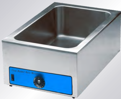
KG-165 Electric Bain Marie