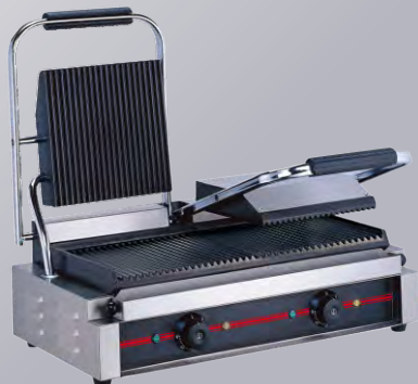
GH-813 Electric contact grill

Dimensions: 16×12×8 inch Power(CE): 2.2KW Volts(CE): 220-240V/50Hz-60Hz Power(ETL&NSF): 1.75KW Volts(ETL&NSF): 120V/50/60Hz Temperature: 300°C Upper grill size: 338×220mm Lower grill size: 338×230mm Heating Elements: 2 Weight: 14kg This model is available in different types of plate. A is both grooved on top and bottom. B is both flat on top and bottom C is top grooved and bottom flat