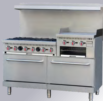
S60-GS24 6 open burners with 24" griddle -broiler

Dimension: 60x32.5x60 inch BTU(open burners):30,000×6 BTU(oven) : 30,000×2 Griddle:24"/40,000BTU