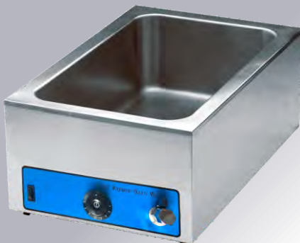
KG-205 Electric Bain Marie

Dimension: 15×22×9 inch Power: 1.2kW Voltage: 220-240V Net Weight: 10.5kg