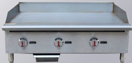
C36GG Countertop Gas Griddle 36" (Manual Control)

Dimension: 24×28×15 inch Power: 2 x 30,000 BTU U style burner 3/4" rear gas connection