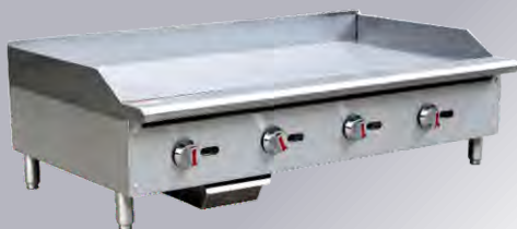
C48GG Countertop Gas Griddle 48" (Manual Control)

Dimension: 36×28×15 inch Power: 3 x 30,000 BTU U style burner 3/4" rear gas connection