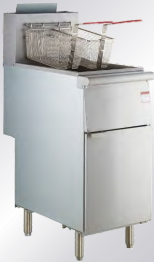
F3 3-tube Gas Fryer