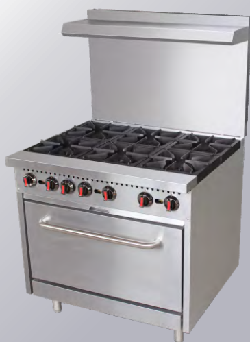
S36 6-burner gas range with oven

Dimension: 24×32.5×60 inch Power: 3/4" NPT gas connection BTU(open burners):30,000×4 BTU(oven) : 30,000 Net Weight: 132kg Gross Weight:162kg