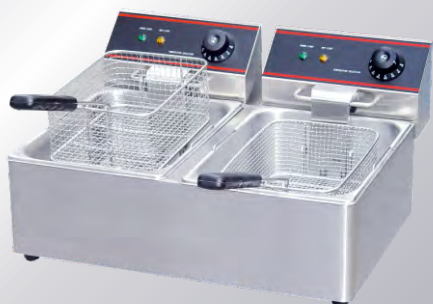
EF-6L-2 Electric 2-Tank Fryer(2-Basket)

Dimension: 12×16×11 inch Capacity: 6 L Power(CE): 2.5 kW Voltage(CE): 220-240V Power(ETL&NSF): 1.75KW Volts(ETL&NSF): 120V/60Hz Net Weight: 5.5kg