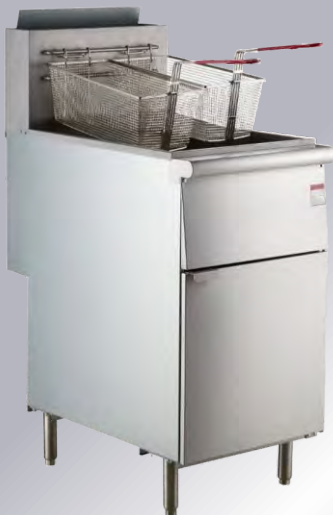
F5 5-tube Gas Fryer

Dimensions: 15.5×30×45.5 inch Power: 120,000 BTU/HR Capacity: 50LB Double Rob Stainless Steel Basket Hanger Stainless Steel Door with Door Stabilizer 6 Inch Adjustable legs (Casters will be an optional accessory)