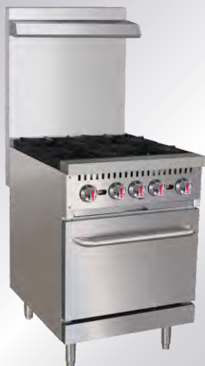
S24 4-burner gas range with oven