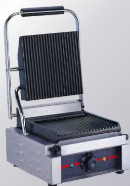
GH-811E Electric contact grill

Dimensions: 11.4×12×8 inch Power(CE): 1.8KW Volts(CE): 220-240V/50Hz Power(ETL&NSF): 1.75KW Volts(ETL&NSF): 120V/50/60Hz Temperature: 300°C Upper grill size: 214×214mm Lower grill size: 218×230mm Heating Elements: 2 Weight: 14kg This model is available in different types of plate. A is both grooved on top and bottom. B is both flat on top and bottom C is top grooved and bottom flat