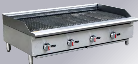
C48CB-SR Countertop Gas Charboiler 48"

Dimension: 36×28×15 inch Power: 3 x 35,000 BTU U style burner 3/4" rear gas connection