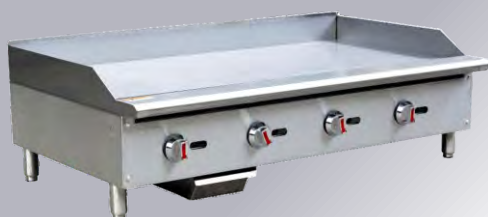
C48TGG Countertop Gas Griddle 48" (Thermostatic Control)

Dimension: 36×28×15 inch Power: 3 x 30,000 BTU U style burner Thermostatic control: 200°F to 575°F 3/4" rear gas connection