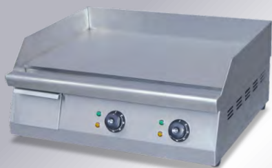
GH-610 Electric griddle

Dimensions: 16×21×11 inch Power: 3KW Volts: 230V