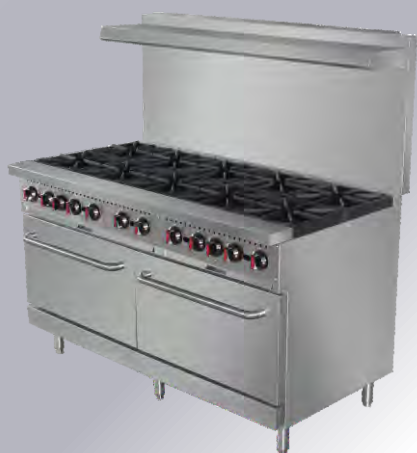
S60 10-burner gas range with oven

Dimension: 36×32.5×60 inch Power: 3/4" NPT gas connection BTU(open burners):30,000×6 BTU(oven) : 30,000 Net Weight: 167kg Gross Weight:207kg