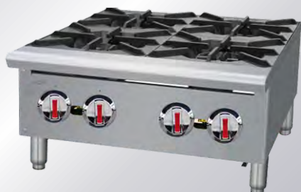
C24HT Countertop Hot Plate 24"

Dimension: 12×28×13 inch Power: 2 x 25,000 BTU 3/4" rear gas connection