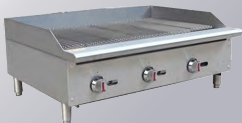
C36CB-SR Countertop Gas Charboiler 36"

Dimension: 24×28×15 inch Power: 2 x 35,000 BTU U style burner 3/4" rear gas connection