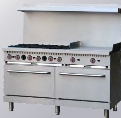
S60-G24 6 open burners with 24" griddle

Dimension: 36x32.5x60 inch BTU(open burners):30,000×2 BTU(oven) : 30,000 Griddle:24"/40,000BTU