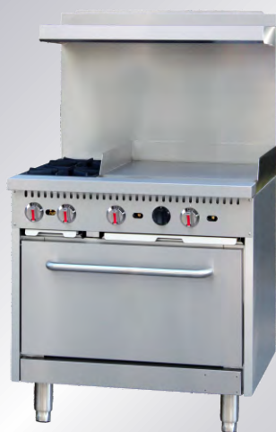
S36-G24 2 open burners with 24"griddle