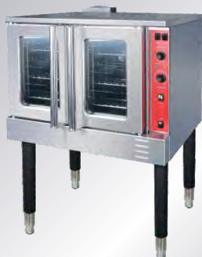
FGC100 Gas convection oven