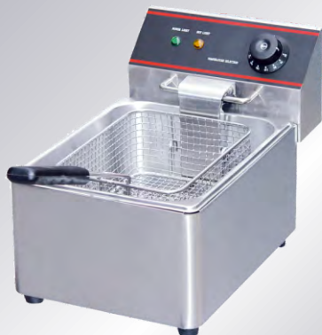
EF-6L Electric 1-Tank Fryer(1-Basket)