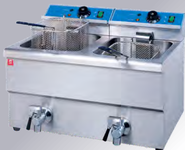
EF-12L-2 Electric 2-Tank Fryer (2-Basket, Counter-top)

Dimension: 11.4×22×16 inch Capacity: 8 L Power(CE): 3.25kw Voltage(CE): 220-240V Power(ETL&NSF): 2.7-3.6KW Volts(ETL&NSF): 208-240V/50/60Hz Net Weight: 7Kg