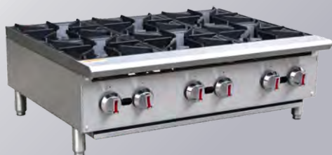
C36HT Countertop Hot Plate 36"

Dimension: 24×28×13 inch Power: 4 x 25,000 BTU 3/4" rear gas connection