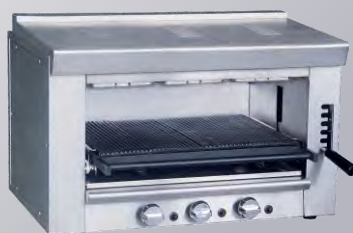
REB-03 Gas Salamander

Dimension: 38 × 41 × 54 inch Chamber Dimension: 29 × 20 × 22 inch Rack Dimension: 21 × 28 inch Voltage: 208-240V/60Hz 1 Ph or 3 Ph Power: 9-11.9KW Electronic thermostat with temperature control range of 150 °F to 550°F 60-minute, continuous-ring timer Control area cooling fan Interior oven lamp Porcelain interior chamber Three nickel plated racks, eleven rack positions with a minimum of 1-5/8" (41mm) spacing