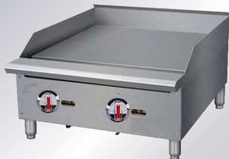
C24TGG Countertop Gas Griddle 24" (Thermostatic Control)