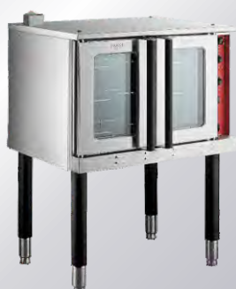
FEC100 Electric convection oven

Dimensions: 38x41x57 inch Power: 3*18000BTU Cavity capacity: 720*545*508=238L Rack dimension: 523*714mm Level distance: 415mm, total 10 levels • Porcelain coated cavity inside and out • High efficiency, even temperature inside cavity