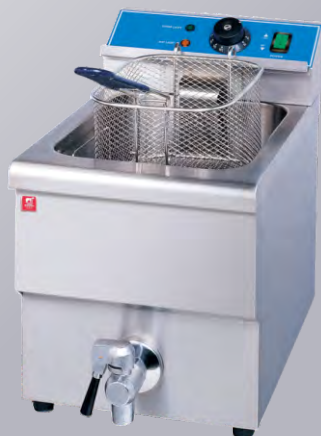
EF-12L Electric 1-Tank Fryer (1-Basket, Counter Top)

Dimension: 22×16×11 inch Power(CE): 2.5KW+2.5KW Voltage(CE): 220-240V Power(ETL&NSF): 1.75KW+1.75KW Volts(ETL&NSF): 120V/60Hz Net Weight: 12kg