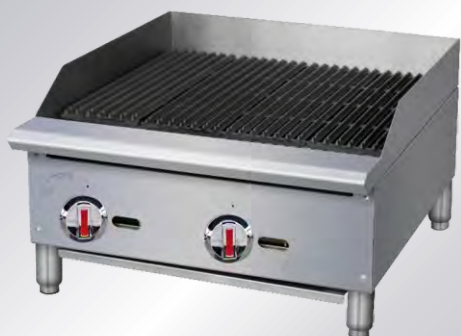
C24CB-SR Countertop Gas Charboiler 24"