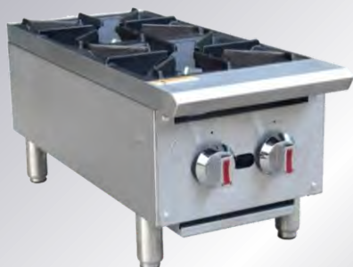
C12HT Countertop Hot Plate 12"