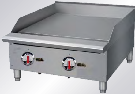
C24GG Countertop Gas Griddle 24" (Manual Control)