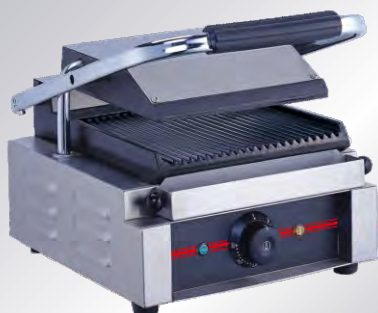
GH-811 Electric contact grill